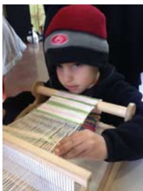
A New Weaver