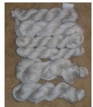
Tour de Fleece yarn