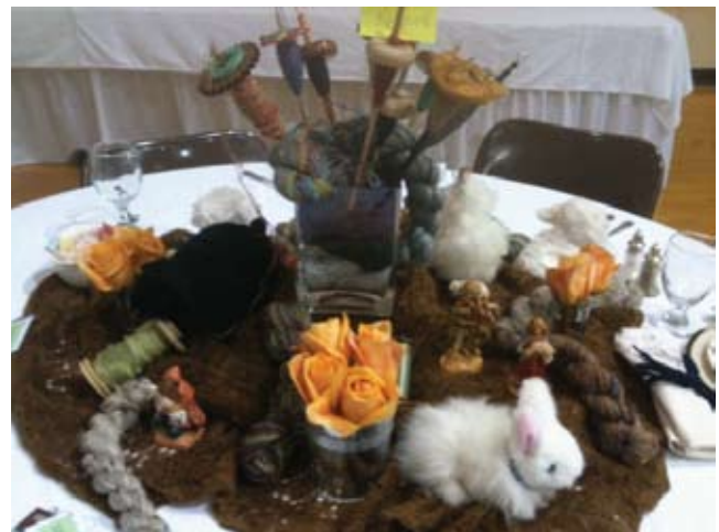
Donna's fiber-inspired centerpiece