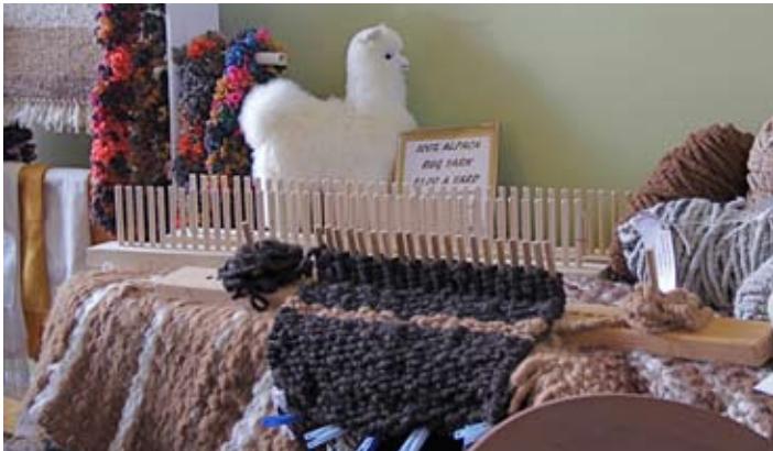
ROC DAY FUN - Friends, fiber, fabrics, projects, yarn, show and tell, spinning, shopping, sharing, weaving, tools, knitting, patterns, garments, roving, rugs, door prizes, dyes, an enjoyable day.

The Chimneyville Weavers and Spinners Guild newsletter is published the first week of each month and is distributed by email to members and friends. For more information, email cvillewsg@gmail.com .