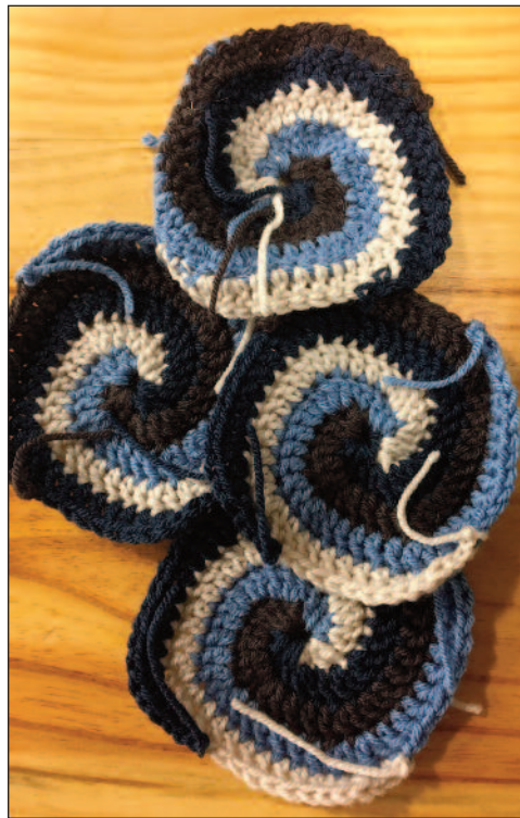
Crocheted spiral motifs by Beth Palmer.

Under Old Business, we discussed plans for a weekend retreat to be held June 8-10 at The Gray Center near Canton. We will rent a cottage there, which can sleep up to 16. Each cottage also has a kitchen and a living room. We will not offer any workshops during our weekend together but rather spend the time enjoying our own fiber pursuits. We plan to eat our meals in the Gray Center dining room. Cost of the weekend retreat is $231. Full payment is due no later than March 24 at our Sheep to Shawl event.