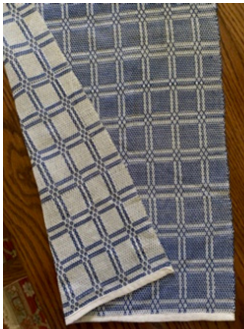
Summer and Winter Tea Towel