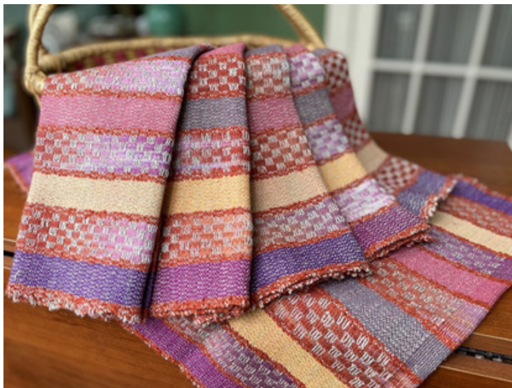
Friendship Towels in Rusty Dusty colorway