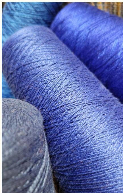
Sapphire blue for CWSG's 45th anniversary in September 2025.