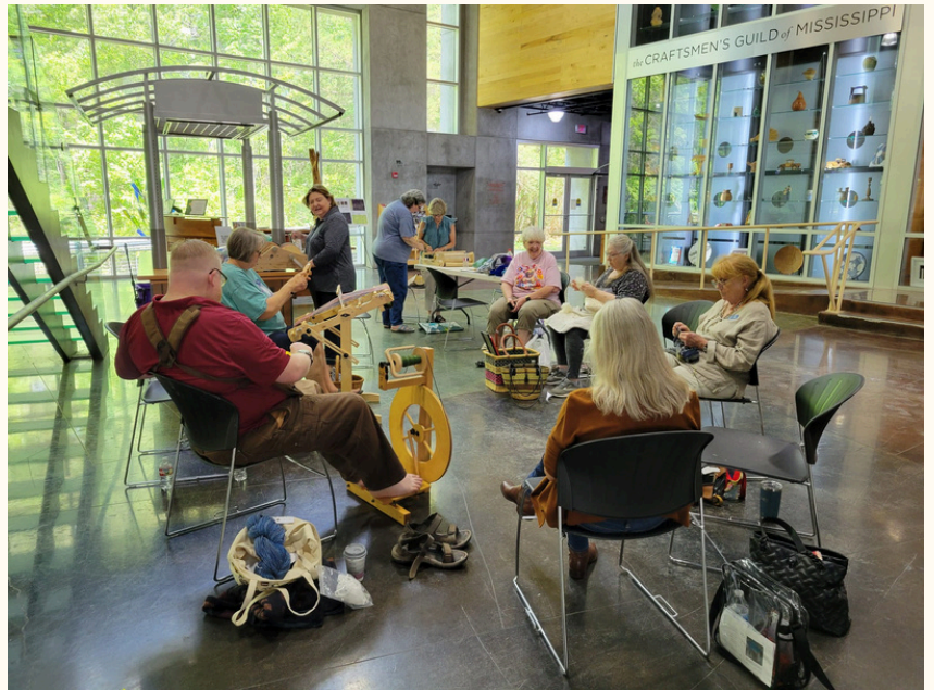
CWSG members crafting together during CWSG's Demo Day at the Craft Center in April.

The "Gathering Exhibition" with the Delta Arts Alliance in Cleveland, Ms. will run from October 7 through November 15. Two fiber pieces must be received by September 27.